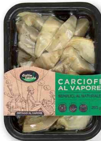
Steamed artichokes 250gr