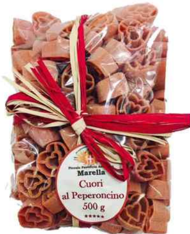
Cuoricini with chili pepper 500gr