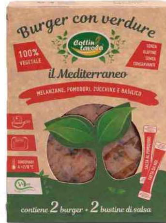
Veg burger Il mediterraneo 270gr