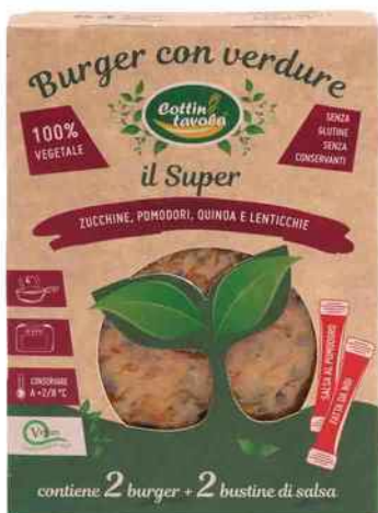
Veg burger Il super 270gr