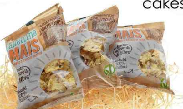
Corn mini cakes 18gr