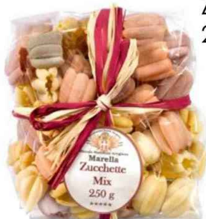
Zucchette mix 250gr