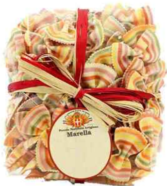
Farfalline rainbow 250gr

Pastificio Marella has been producing artisan Pasta made of durum wheat and only natural ingredients since 1987. Rough texture, unique taste and beautiful colorful shapes are unique features of this special Pasta.