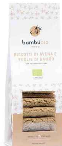
Oats cookies with bamboo leaves 200gr