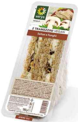
Sandwiches seitan mashrooms 2x75gr