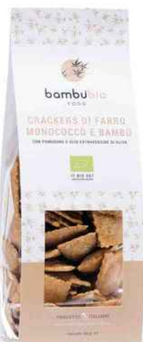
Monococco spelt crackers with bamboo leaves 200gr