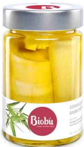
Bamboo buds in seed oil 190gr

bambùbio® The all-Italian plantation of BambùBio boasts more than 2,000 plants grown without the use of pesticides or chemical agents. The result is Biobù, an entire line of products realized with the bamboo's edible and nutrient-rich shoots and leaves.