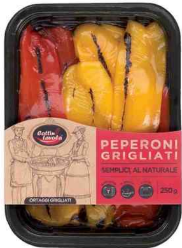
Grilled peppers 250gr