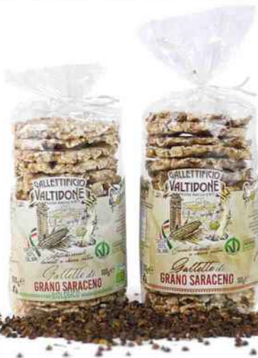
Buckwheat cakes 100gr

The mission of Galletificio Valtidone is to create high quality products, naturally enhancing the characteristics of the noble cereals used (corn and buckwheat), bringing a fresh and genuine product to the table.