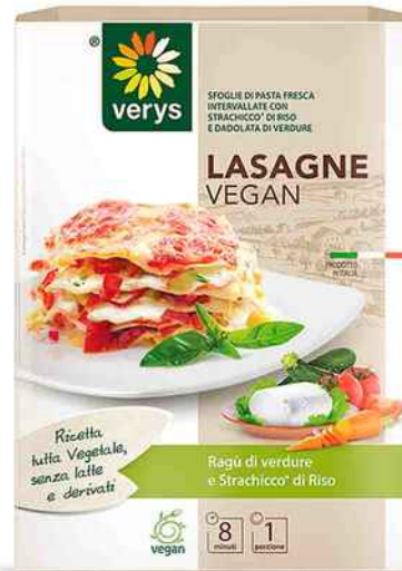
Lasagne vegetables strachicco 300gr