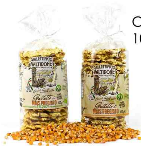
Corn Cakes 100gr