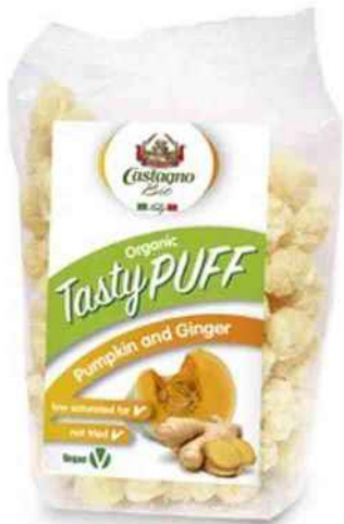
Pumpkin & ginger snacks 50gr

Tasty Puff is an irresistible and healthy snack certified organic and vegan. A true delight thought for the consumers' well-being, perfect for every time of the day. It is produced only with 100% Italian corn with the addition of spices, aromatic herbs and vegetables to offer a wide range of unique tastes.