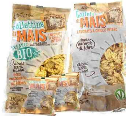
Corn mini cakes 120gr