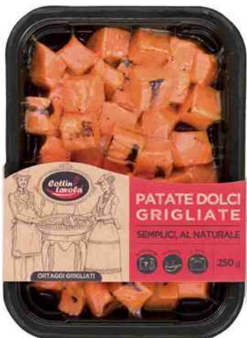
Grilled sweet potatoes 250gr