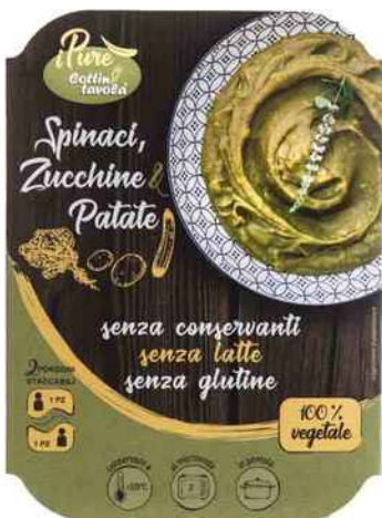
Potato zucchini spinach puree 2x200gr