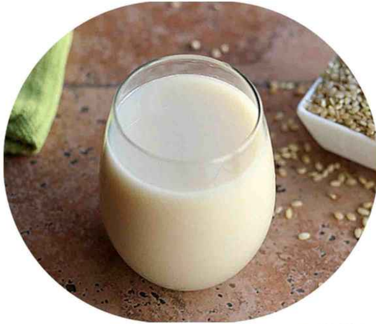
Biosurice drink 1L