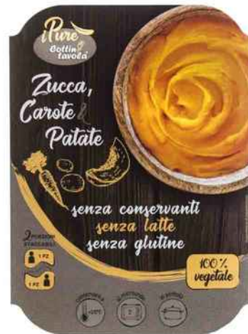
Pumpkin carrots potato puree 2x200gr