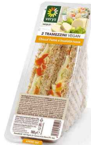
Sandwiches chicca fumè egg salad 2x75gr