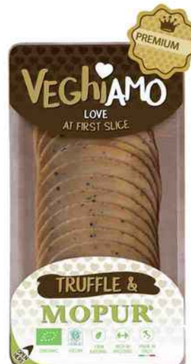
Truffle & mopur 90gr