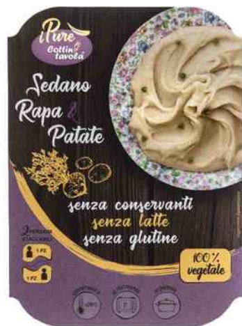
Celeriac potato puree 2x200gr