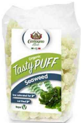
Seaweed snacks 50gr