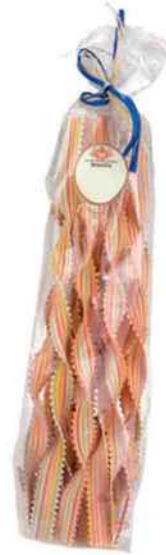
Mother in law tongue 250gr