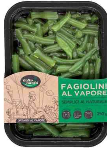
Steamed green beans 250gr