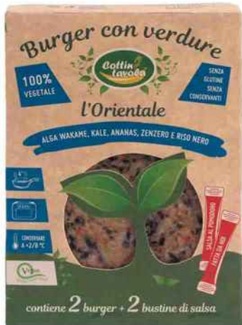
Veg burger L'orientale 270gr