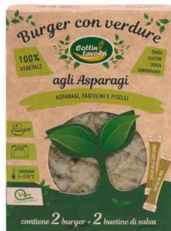
Veg burger Asparagus 270gr