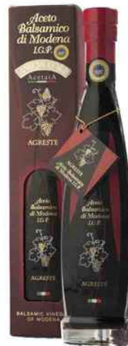
Superior Balsamic Vinegar of Modena PGI "Agreste" 250ml