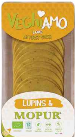
Lupins & mopur 90gr