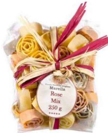
Rose mix 250gr