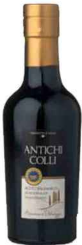
Balsamic Vinegar of Modena PGI "Invecchiato" 250ml

Antichi Colli is a family-owned company that produces exceptional condiments. All the vinegars of the line are vegan and can be used to produce many classic and innovative combinations, especially in the modern creative cuisine.