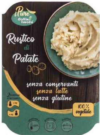
Potato puree 2x200gr

Riverfrut Cottintavola line includes a range of plant-based products characterized by the total absence of additives or preservatives while still maintaining all the properties of fresh vegetables.