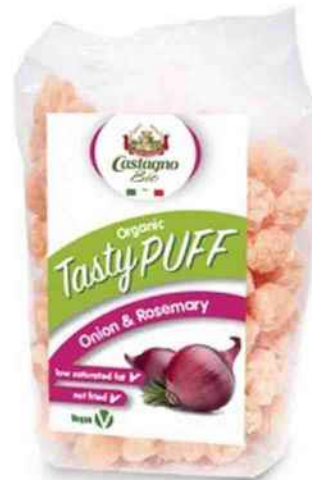
Onion & rosemary snacks 50gr