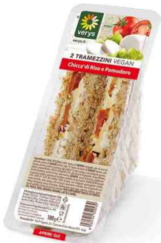
Sandwiches chicca tomato 2x75gr