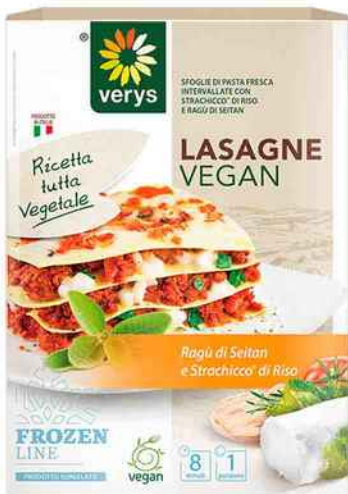
Lasagne strachicco ragout seitan 300gr