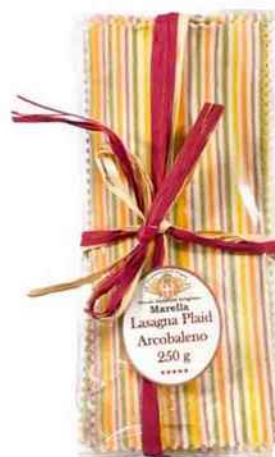
Lasagna plaid 250gr