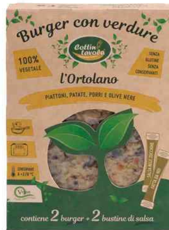
Veg burger L'ortolano 270gr