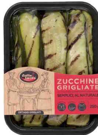
Grilled zucchini 250gr