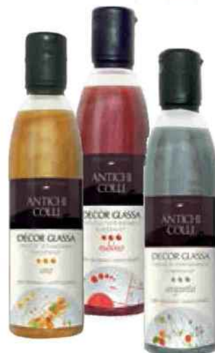
Decor glassa 250ml: - gold - silver - ruby