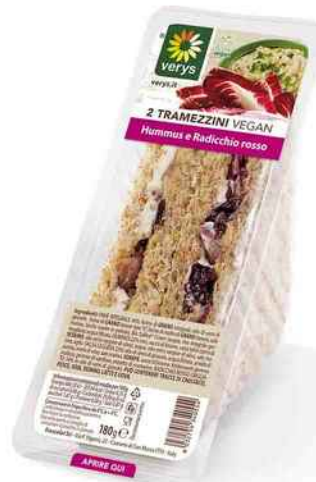
Sandwiches hummus red chicory 2x75gr