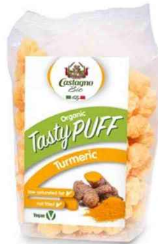
Turmeric snacks 50gr