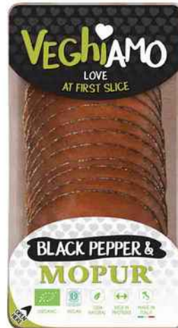
Black pepper & mopur 90gr