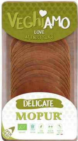
Delicate mopur 90gr

The Veghiamo Mopur is a 100% vegan product, plant-based, high in proteins and OGM free. An excellent nutrition source for those who choose to follow a vegetarian lifestyle or simply want to enjoy a real meat alternative.