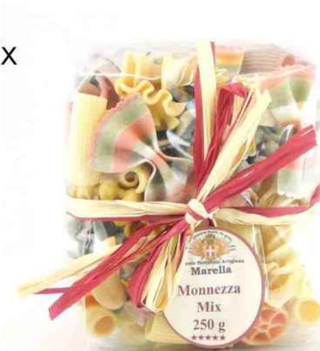
Monnezza mix 250gr