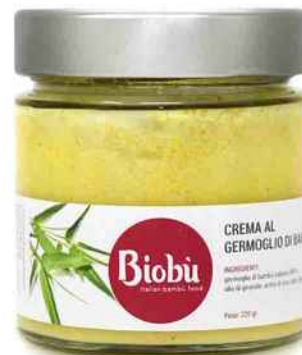
Bamboo buds cream 220gr